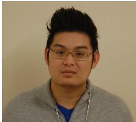
Courage Nou Wildcat Times Correspondent

April 22 nd is Earth Day, a day when people give something back to the earth and their community.