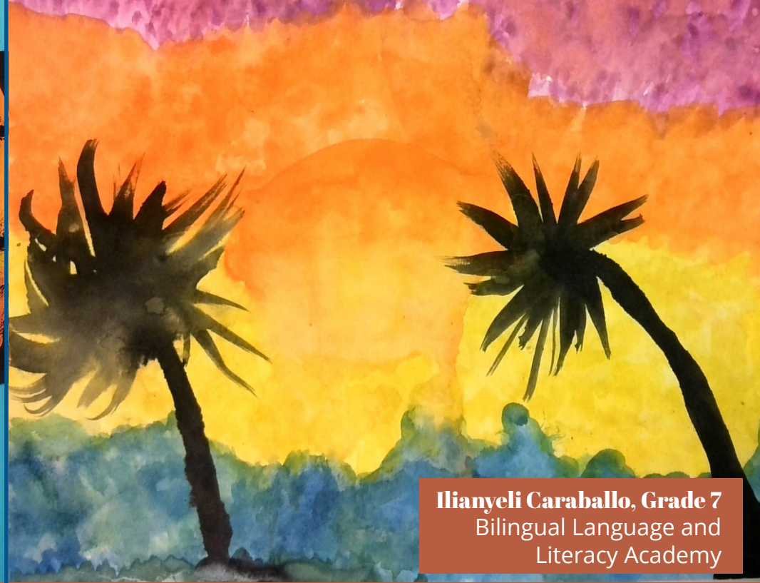
Ilianyeli Caraballo, Grade 7 Bilingual Language and Literacy Academy